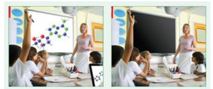
Eco AV mute off 100% power consumption

Stay in control of your presentation with Eco AV mute. Direct your audience's attention away from the screen by blanking the image when no longer needed. This also reduces the power consumption by up to 70%, further prolonging the life of your lamp.