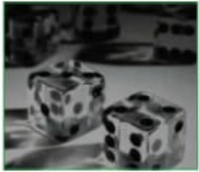
2000:1 Contrast Ratio

Add more depth to your image with a high contrast projector; with brighter whites and ultra-rich blacks, images come alive and text appears crisp and clear - ideal for business and education applications.