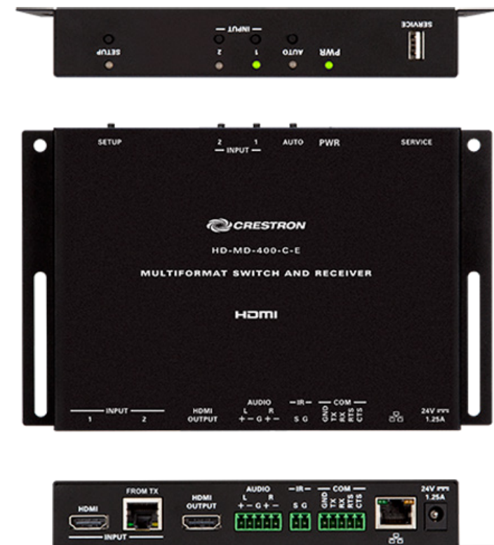
HD-MD-400-C-E Receiver – Top, Front, and Bottom Views