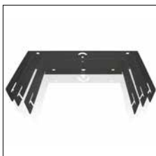
ARQIS U BRACKETS