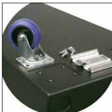
QRA + WH200