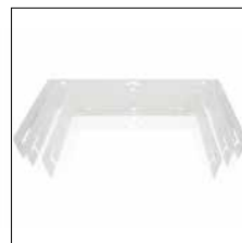
ARQIS U BRACKETS

MP103AMB2 is a cluster hardware for 2 eAMBIT103 units.