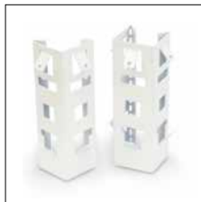
MP106NEST2 / 3