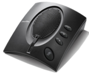
CHAT 70-U 910-159-257