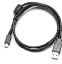
CHAT USB Cable 830-159-001