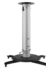
Ceiling Mount: 5JJAM10.001