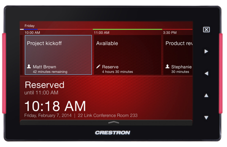
TSS-752-B-S - Shown in "Reserved" state