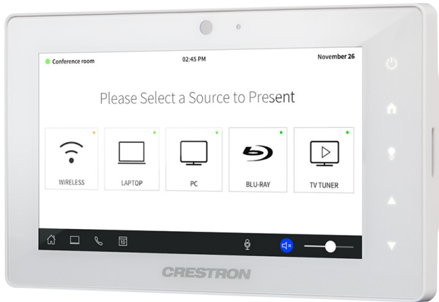
TSW-560-W-S – Shown in White