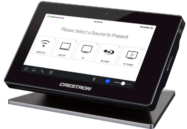
TSW-560-B-S with TSW-560-TTK-B-S Tabletop Kit

High-performance streaming video capability makes it possible to view security cameras and other video sources right on the touch screen.