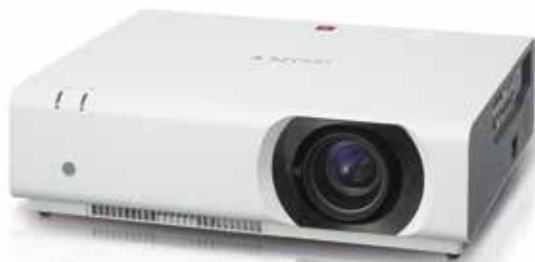
VPL-CH355, VPL-CH375 and VPL-CH350

When it comes to equipping medium to large-sized classrooms or meeting rooms, cost is critical. The VPL-CH355, VPL-CH375 and VPL-CH350 are a cost-effective choice with no compromise on picture quality.