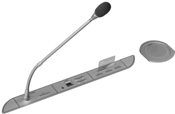
Combination of N-style units