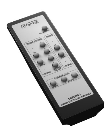
CONCEPT1-RC Remote control for Concept1 amplifier