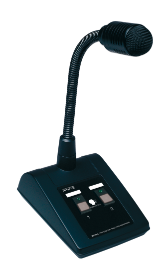
MICPAT-2 Selective 2-zone paging station