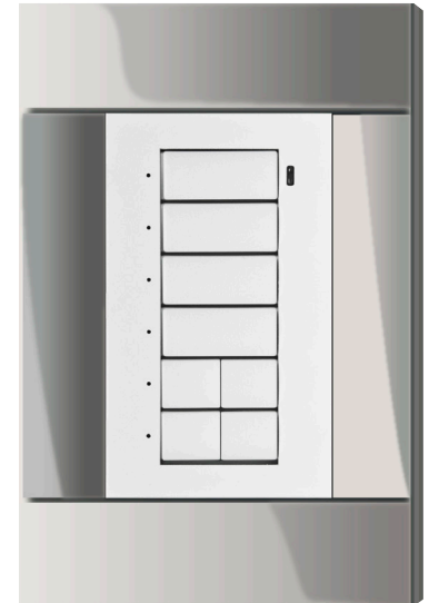
Black and white shown (Vimar cover plates not included)

Specially designed for use with Vimar™ brand mounting boxes, frames, and cover plates, the Cameo® C2N-CBV-P keypad offers a custom control solution for yachts and other installations.