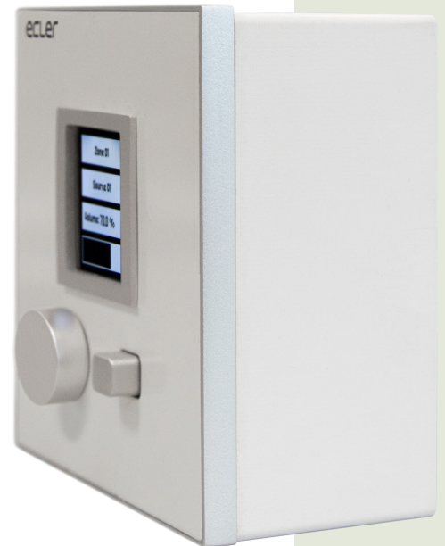
eMCONTROL1 With surface-mount installation box (included)