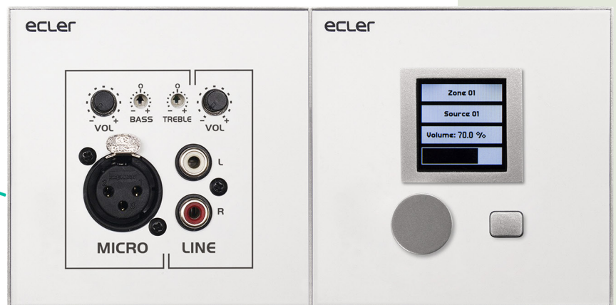
WPaMIX-T + eMCONTROL1 + WPa2SMBOX / WPa2FMBOX

Different mounting options available: fully compatible with single/double, surface/flush WPa series mount boxes