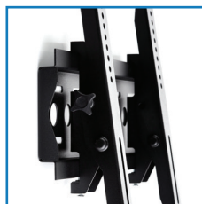
Possibility of tilting the screen from -12^{\circ} to +6^{\circ}