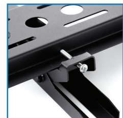
security screws prevent from accidental fall or unauthorised removal of a screen