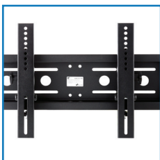
The support plate features numerous holes for installation on concrete and wooden surfaces