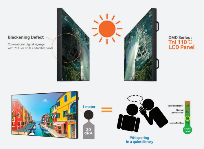
Figure 4. Heat endurance and low noise for semi-outdoor use

Multiple connectivity options are available, including Wi-Fi connectivity and a mobile application which, together, support easier management. To maximize usage of the built-in Wi-Fi feature, Samsung provides the MagicInfo Mobile Application, which can be used on a tablet or other mobile device to easily deliver content to the display or to update the display's templates or content. The MagicInfo Server solution also enables professional management of multiple displays through a Wi-Fi network. In some cases, the available SD Card may be a better connectivity option than a USB memory stick because the card is designed for external environments in which the USB stick might be vulnerable to loss or theft.