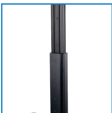
Fully adjustable height