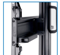
Integrated cable management system for smart installation