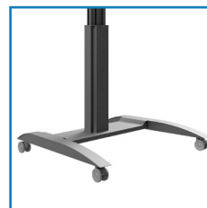
Non-marking braked casters