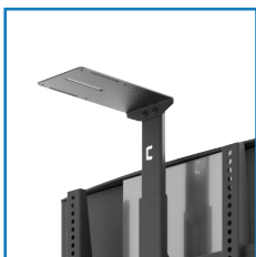
Equipped with shelves for a camera and a decoder