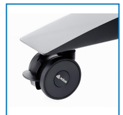
4 braked castors