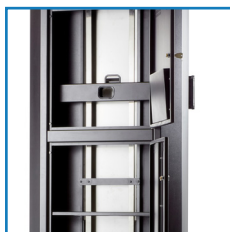
Includes compartment for AV accessories