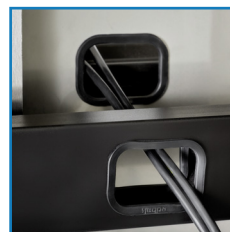
Cable management system