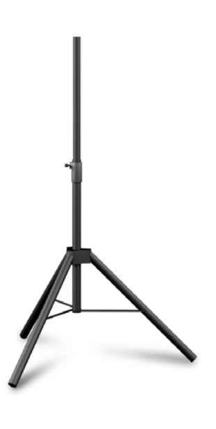
STFLOOR Floorstand for speaker with pole adapter