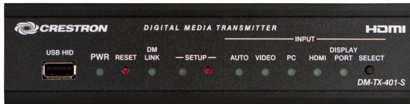
DM-TX-401-S – Front View